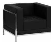
SORRENTO CHAIR BLACK