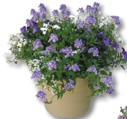
April Blue Bird