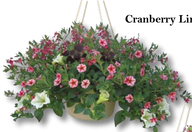
Cranberry Lime Twist