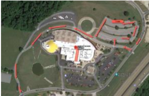
Traffic guide of food distribution.

Feed America First, in partnership with the National Corvette Museum, will host a food distribution on Saturday, January 15, 2022, to serve those affected by the recent tornados in the Bowling Green area.