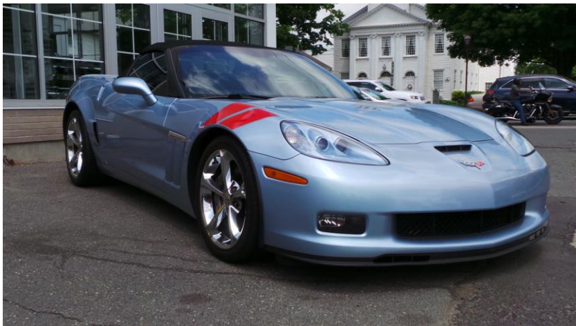
#5 and it's a Carlisle Blue 2012 Grand Sport my early Father's Day gift I got this past Saturday

We are also just about done with all the planning for our August picnic, great food, location and fellowship, watch for more info.